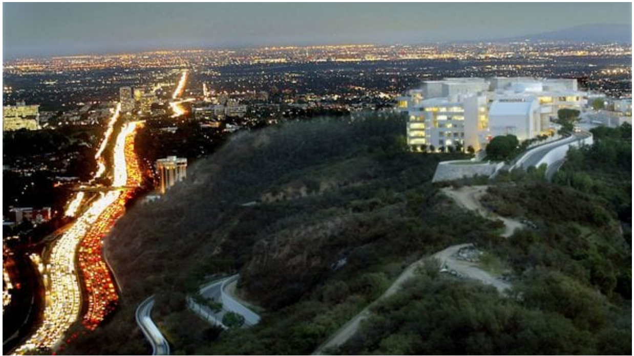
The Getty Center, overlooking the 405 Freeway in Los Angeles.