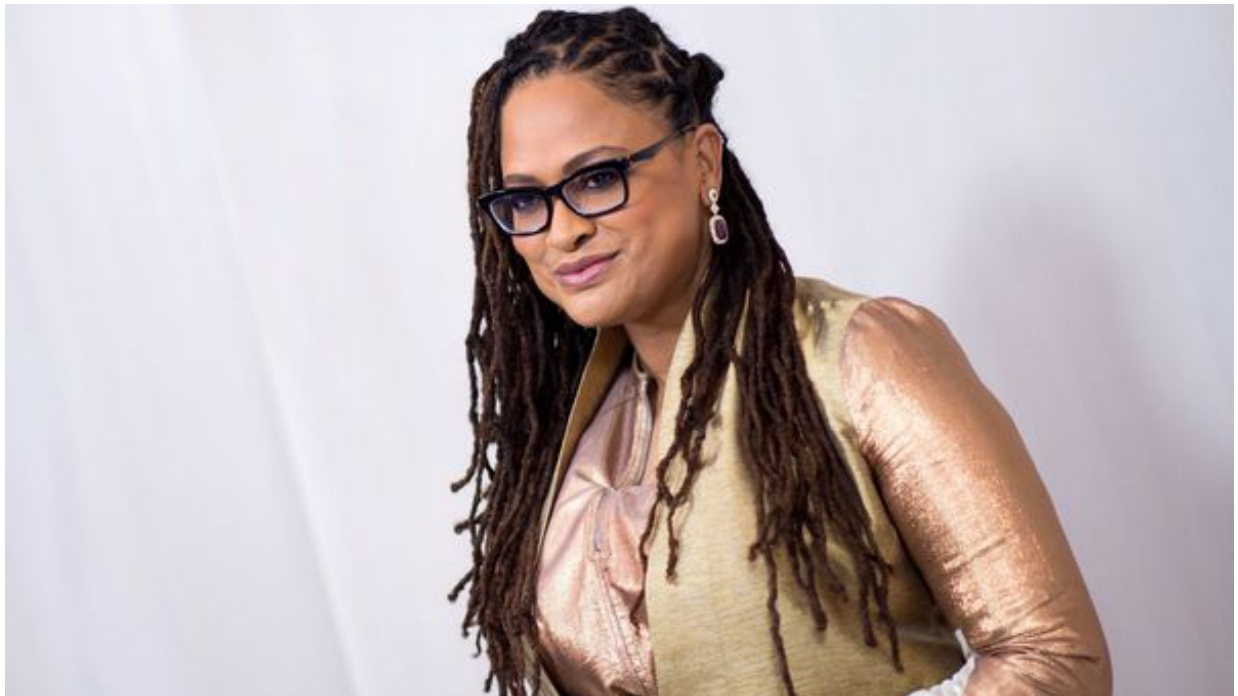
Ava DuVernay at the Hammer Museum's Gala in the Garden.