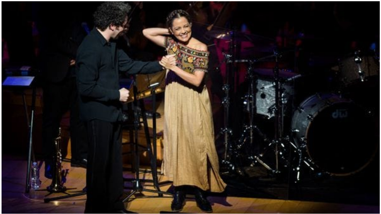
Gustavo Dudamel and singer Natalia Lafourcade at the opening concert of CDMX.