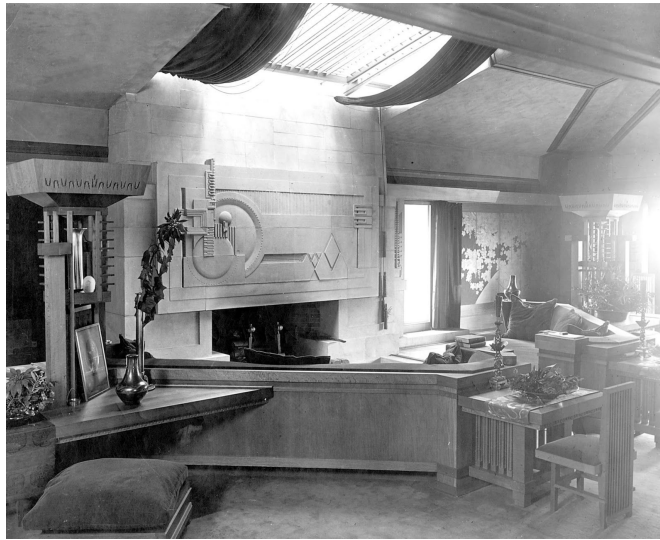
Hollyhock House in 1927.

The residents of the houses picked up on it too: that alongside the ambition and moments of grandeur in these houses was something darker, even tragic.