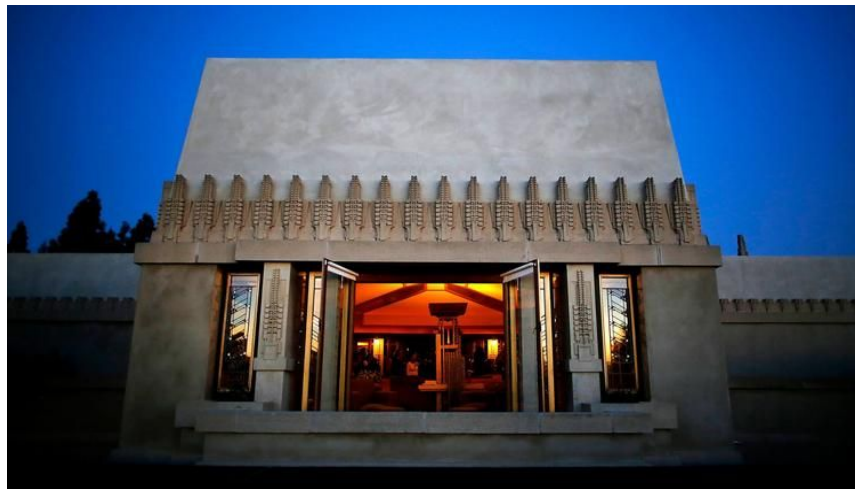
Hollyhock House, designed by Frank Lloyd Wright for oil heiress Aline Barnsdall.

http://www.latimes.com/entertainment/arts/la-et-cm-frank-lloyd-wright-houses-20170608-htmstory.html