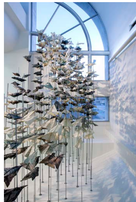
Elevate by Joyce Dallal

Many of the new exhibition sites have been thoughtfully selected to enliven and enrich how people experience the airport. For example, Flow and Glimpse by Barbara Strasen in Terminal 2 and Elevate by Joyce Dallal in Terminal 3, are dramatic, large-scale installations that transform the departures atriums. Flow and Glimpse depicts the rich textures and diversity of Los Angeles through 90 lenticular panels that change in response to the location of the viewer. Elevate consists of two large sculptural