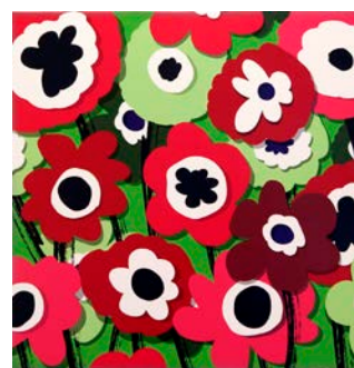
#LAXPOPPIES by Jorge Oswaldo

Additional Influx installations include #LAXPOPPIES by Jorge Oswaldo, located in the central meet and greet area of Baggage Claim in Terminal 1. Consisting of eight bold, expressive, and brilliantly colored canvases depicting poppies, this site-specific installation reinterprets the tradition of greeting a loved one at the airport with flowers for the age of social media. For ticketed passengers, Terminal 1 also offers Eileen Cowin's Point of Departure , located in the main Departures concourse, which inverts the traditional art display case, creating in its place a large-scale story box consisting of four evocative, and somewhat mysterious, photographs, as well as My Life in Airports by Deborah Aschheim, a gallery-like installation at Gate 2 featuring more than 125 ink drawings from the artist's travel diary. In the Tom Bradley International Terminal, also for ticketed passengers, Cynthia Minet has created Packing (Caravan) , a colorful and whimsical parade of four life-size domesticated animals made from recycled and re-purposed plastics and illuminated with LED lights.