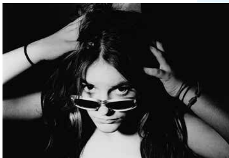
See back cover for credits