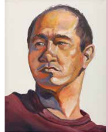
See back cover for credits