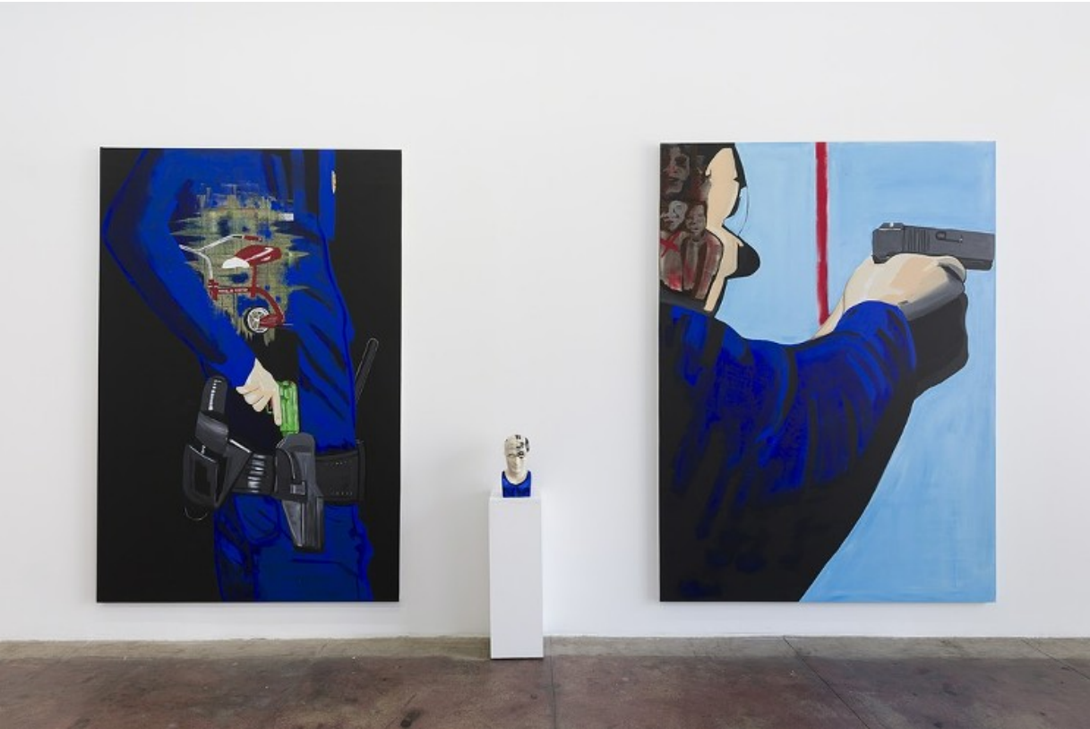
Forrest Kirk, Body Count (2018), installation view