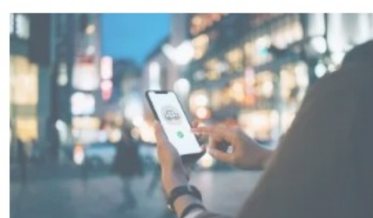
Can public transit and TNCs get along? July 26, 2019 In "Policy & Funding"

Preview of March Regional Service Council meetings It's March and all Regional Service Councils will return to their normal monthly meeting locations and times instead of meeting around one of the NextGen workshops they hosted like last month (NextGen Bus Plan workshops March 2, 2020 In "Policy & Funding"