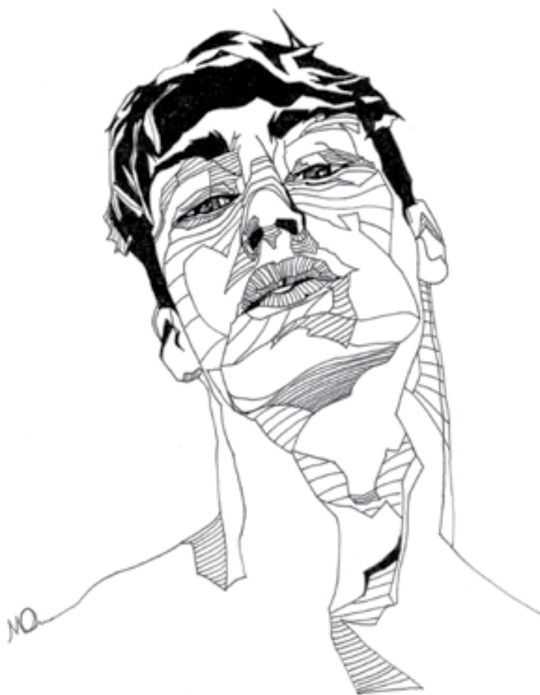
Michael Osborne, Lewk at Me , Archival ink on paper, 8" x 10", 2020