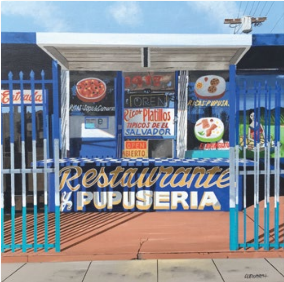
Harold Cleworth, Pupuseria , Acrylic on canvas, 36" x 36", 2016