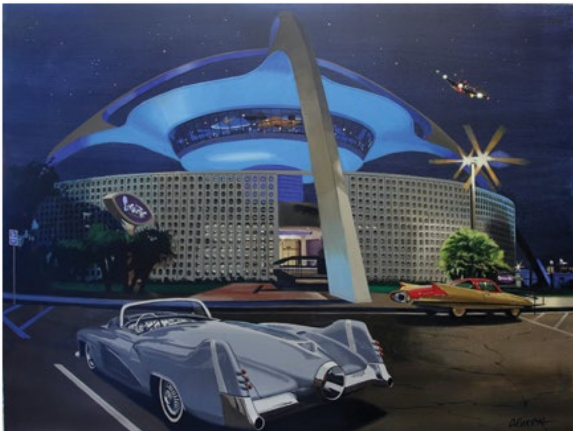
Harold Cleworth, The Encounter , Acrylic on canvas, 48" x 36", 2014