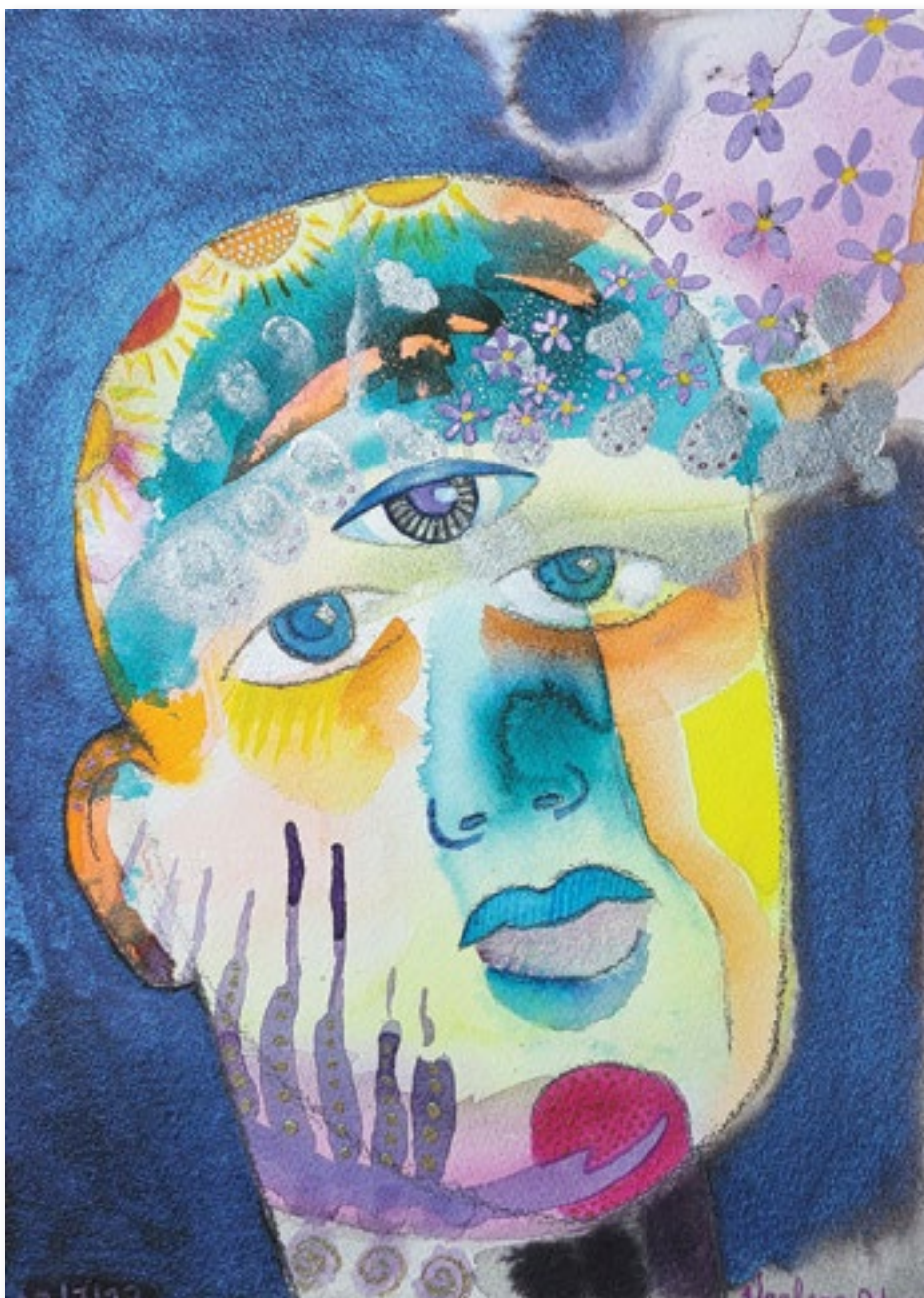
Verlena L. Johnson, Sorrow: Pure Imagination , Watercolor on paper, 12" x 16", 2022