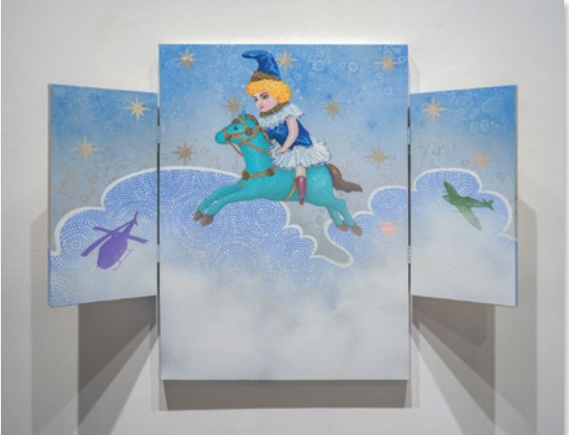
Vojislav Radovanovic, Europa , Assembled triptych, mixed media on canvas, 40" x 54", 2022