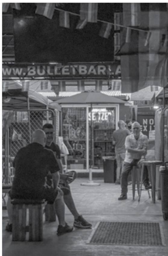
Mike D. Salazar , Welcoming Glances , Digital photography, 8.6" x 13", 2021