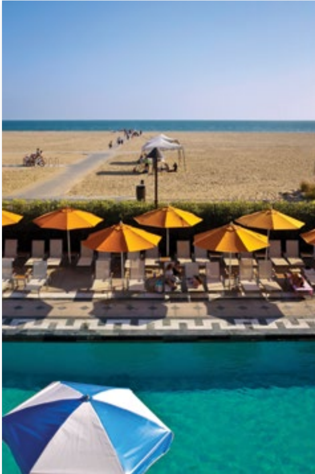
David Stine, Spots of Joy , Digital photography, 11" x 14", 2018