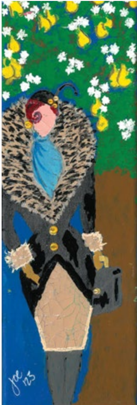
Joe Torres III , Patti in a Pear Tree , Acrylic on canvas, 2023