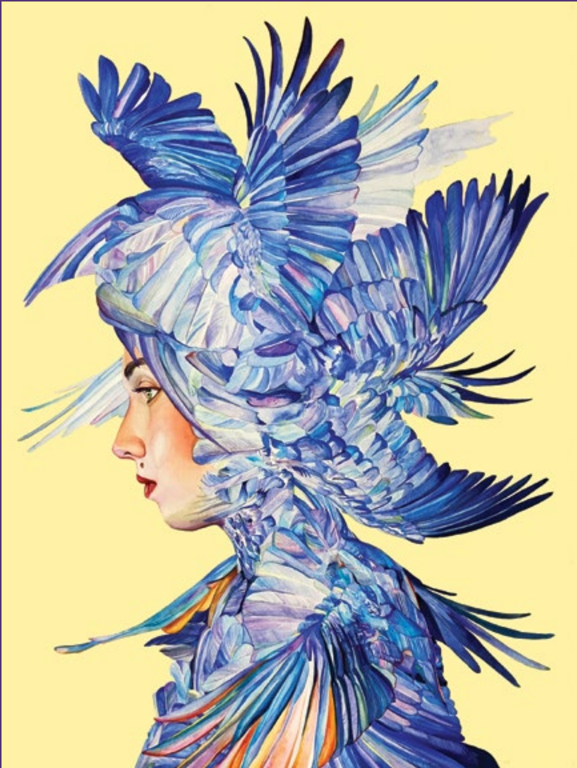
Holly A. Vigil, Feathers , Watercolor, 30" x 22", 2022