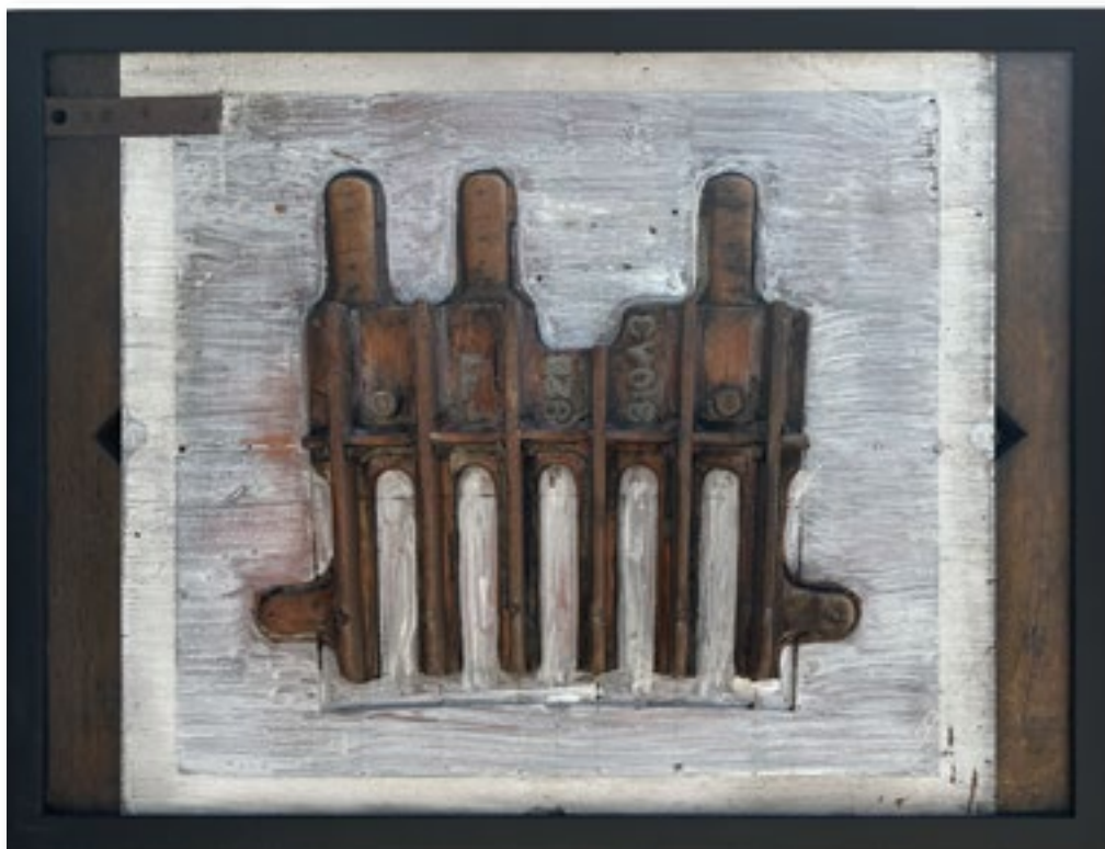
Lou D'Elia, Ode to Thelonious Monk (Abstract #1) , Assemblage, 28.5" x 22" x 2", 2022