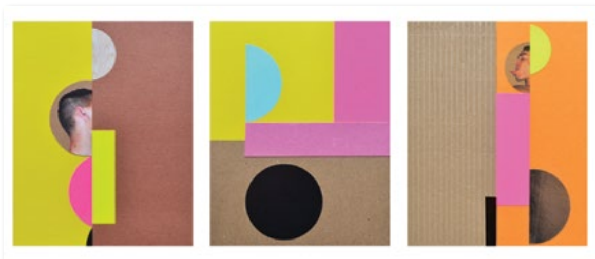
Rubén Esparza, Colibri Y Serpiente de Barragan , Mixed media collage ( triptych ), 10" x 8", 2020