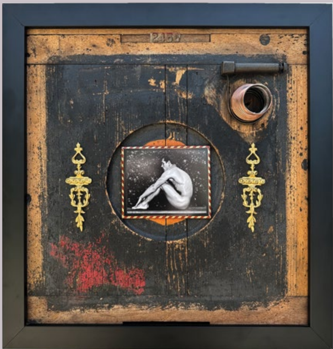
Lou D'Elia, Daddy's Boy , Assemblage, 18.5" x 18" x 2.75", 2021