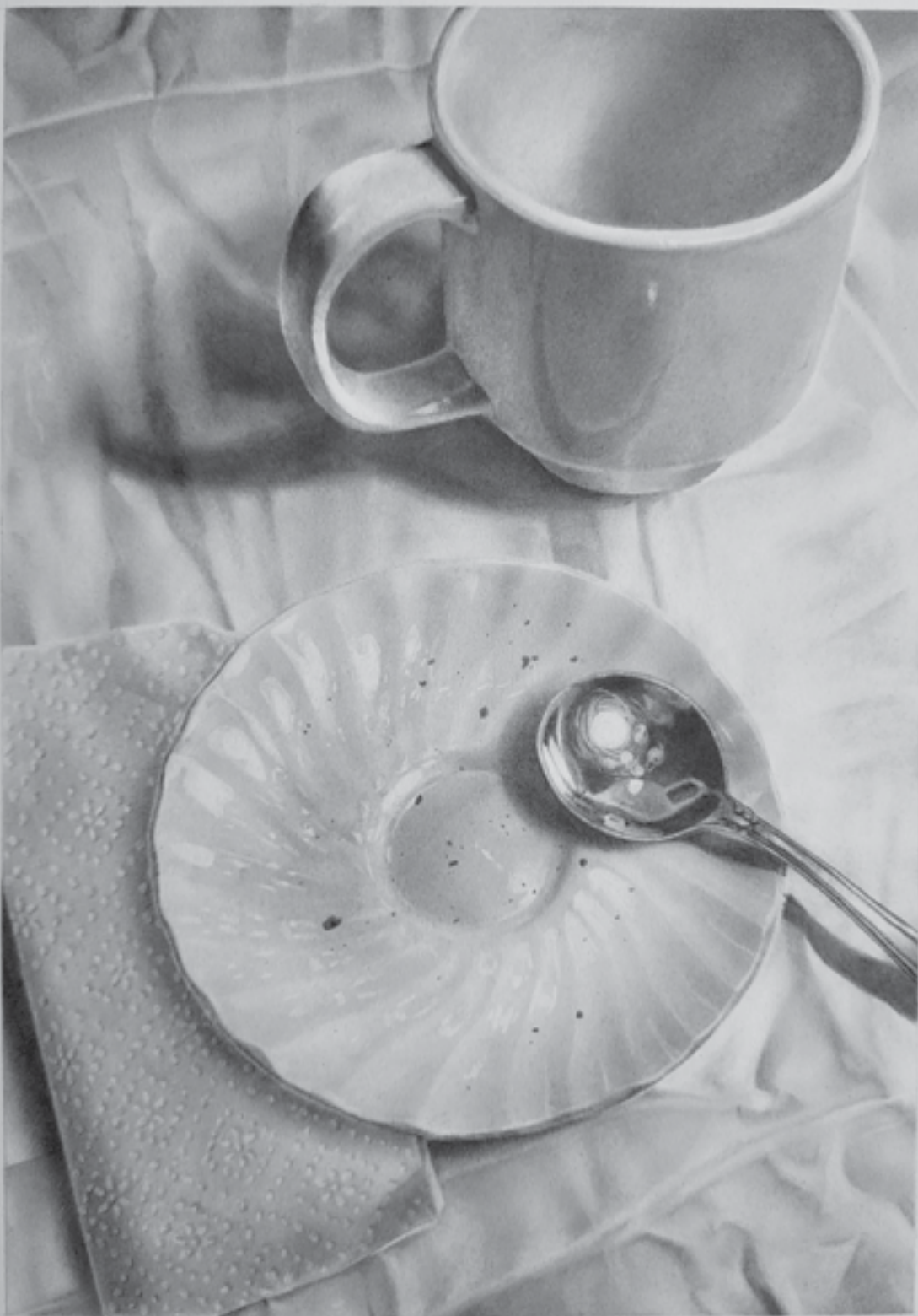
Linda Rygh, Breakfast for One , Graphite, 9" x 13", 2019