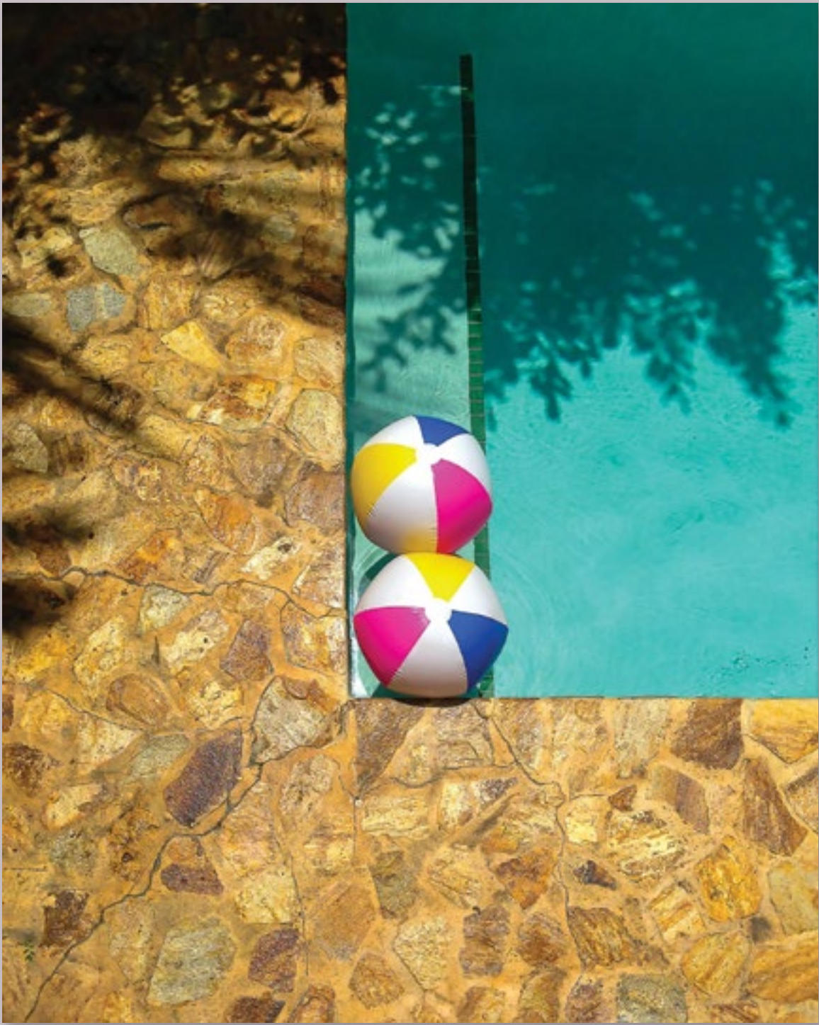
David Stine, Summer Joy , Digital photography, 11" x 14", 2012