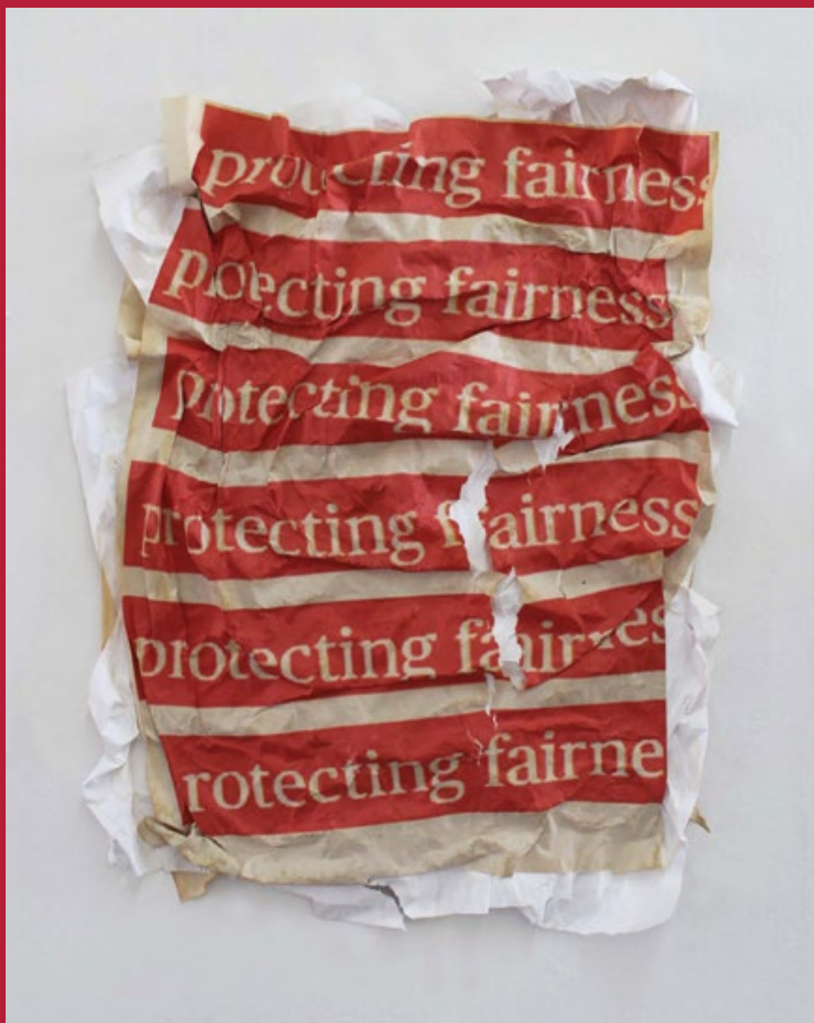
Markus Denil, Protecting what's important , Newsprint, white glue, 24" x 18", 2022