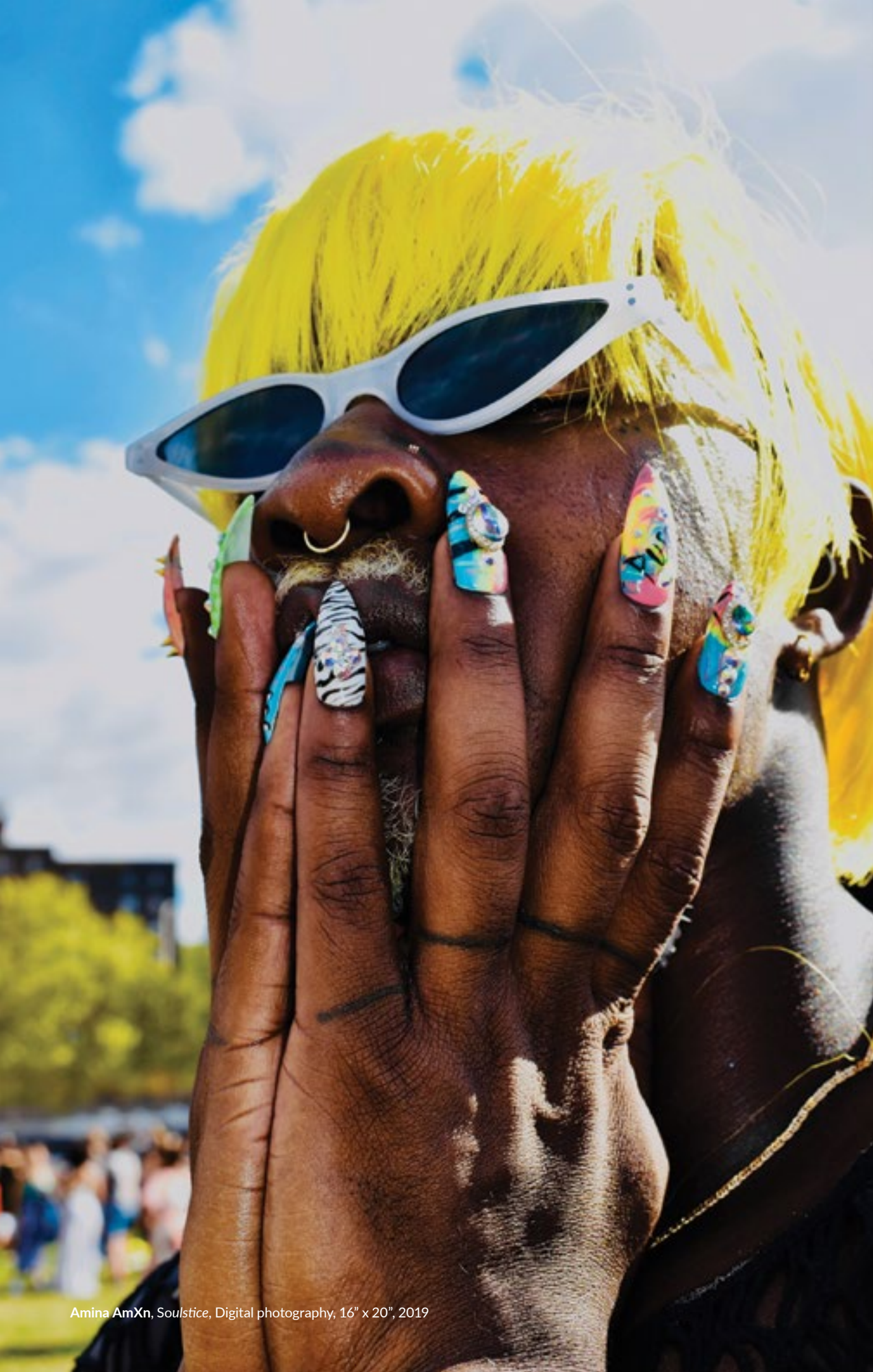
Amina AmXn, Soulstice, Digital photography, 16" x 20", 2019