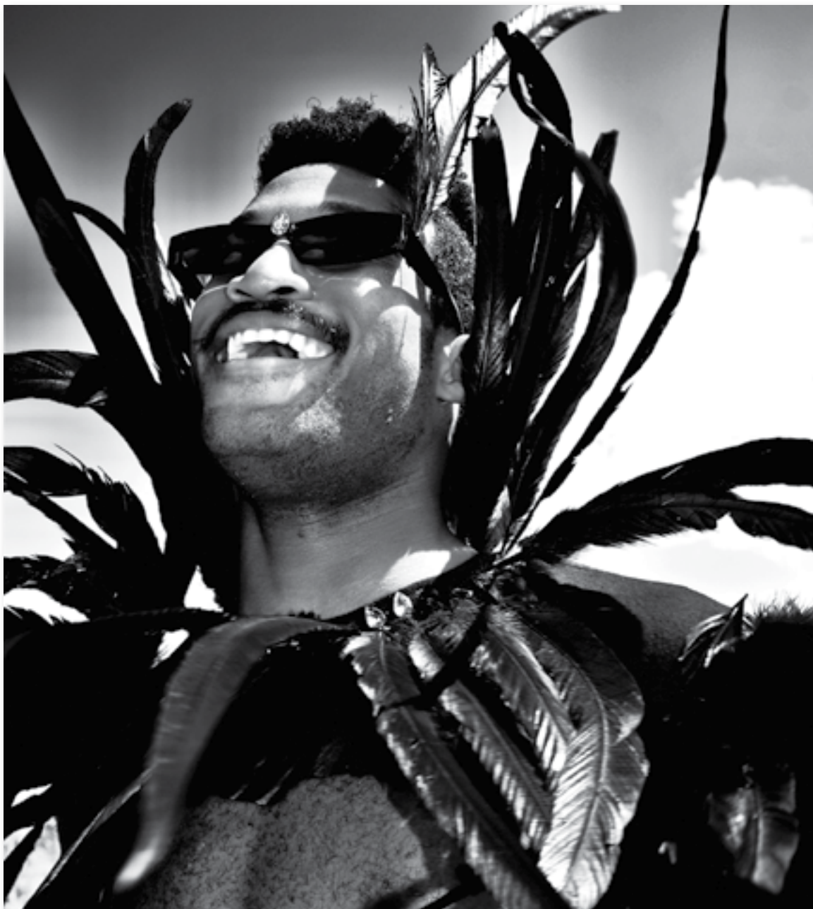
Amina AmXn, Nubian God , Digital photography, 16" x 20", 2019