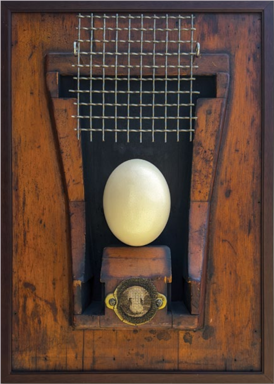
Lou D'Elia, The Big What If , Assemblage, 28.25" x 20.25" x 3", 2023