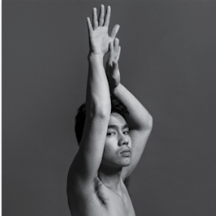
Tirdad Aghakhani, Pheasant , Digital photography, 20" x 20", 2022

5568 Via Marisol Los Angeles, CA 90042 323.259.0861