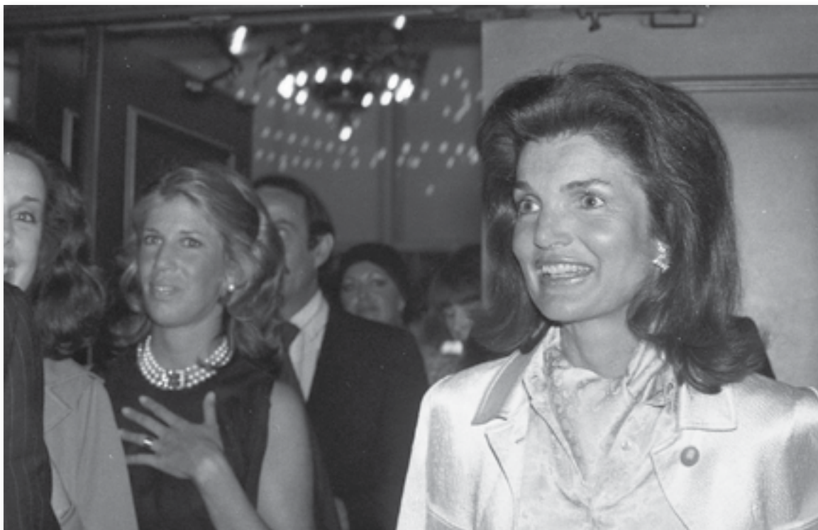
Sunny Bak, Jackie O, Black and white archival print, 1975