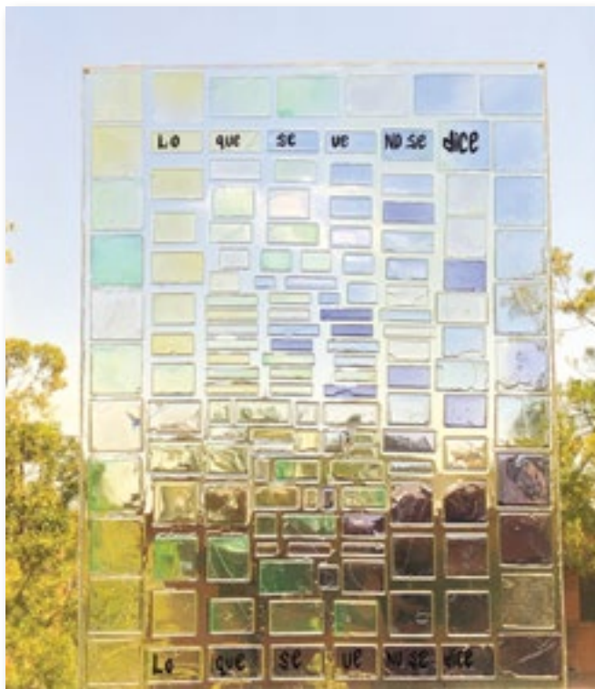
Oscar Corona , Lo Que Se Ve No Se Dice , Epoxy resin, pigment, plexiglas, 36" x 48", 2023