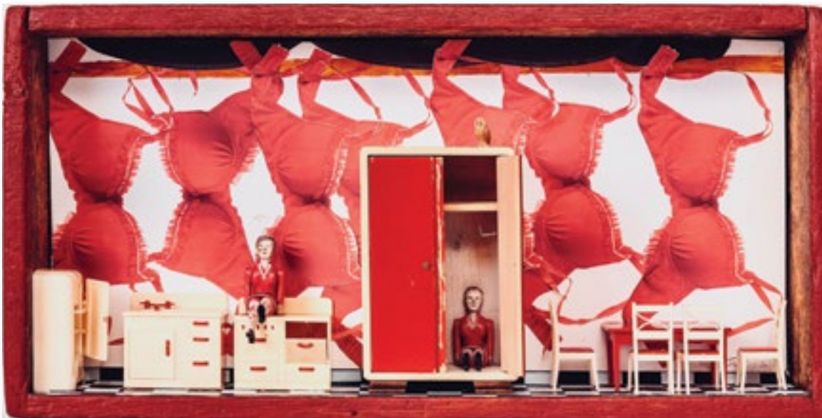
Dwora Fried, In the Closet , Assemblage, 2023