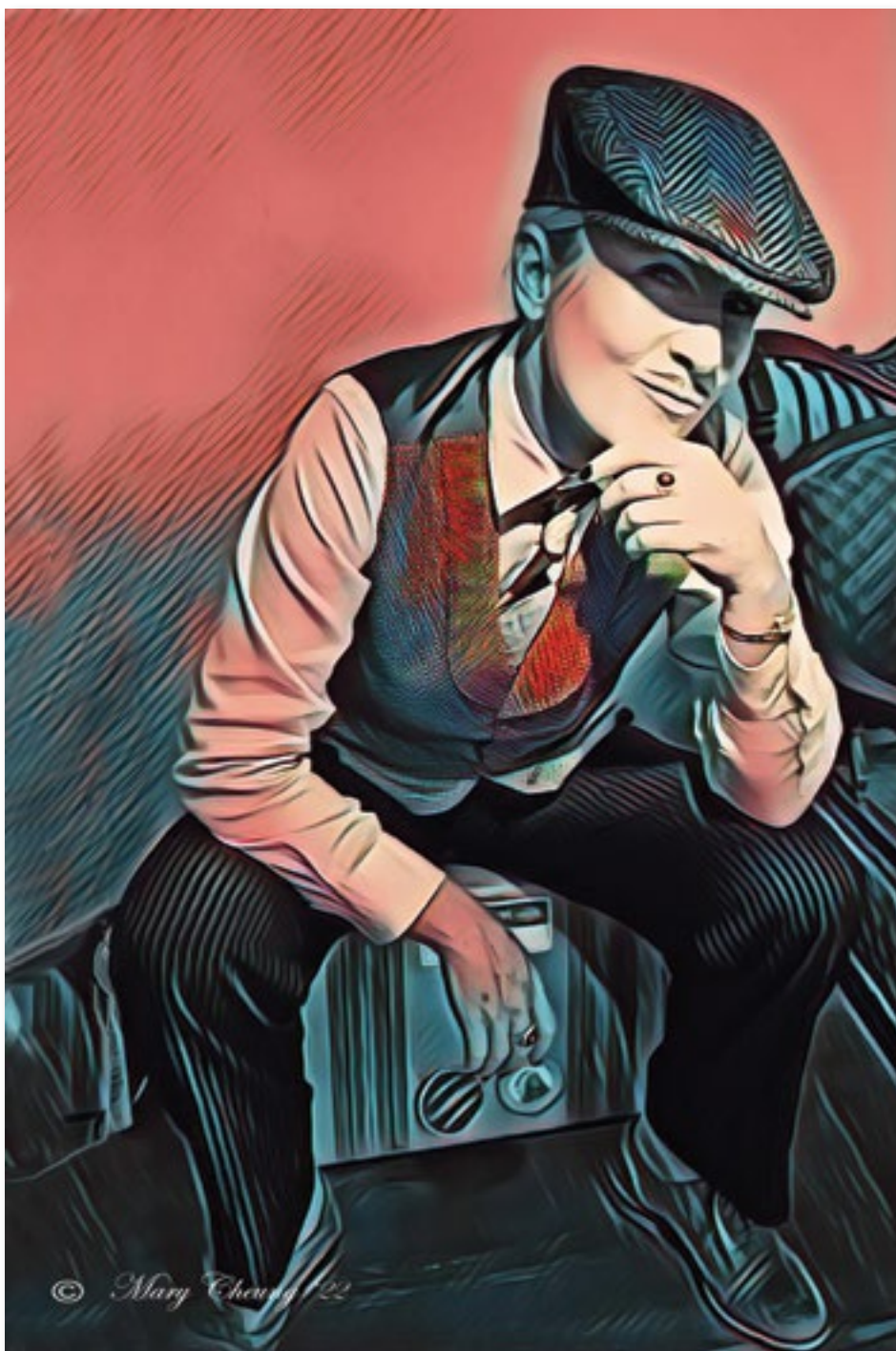
Mary Cheung, One Kool Kat , Digital photograph art, 12" x 18", 2022