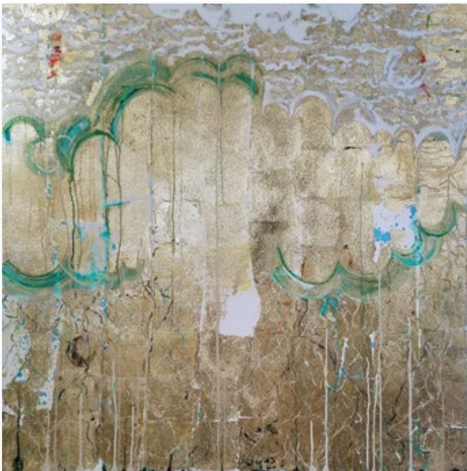
Jason Soltero, Desideratum , Metal leaf and acrylic on canvas, 48" x 48", 2016