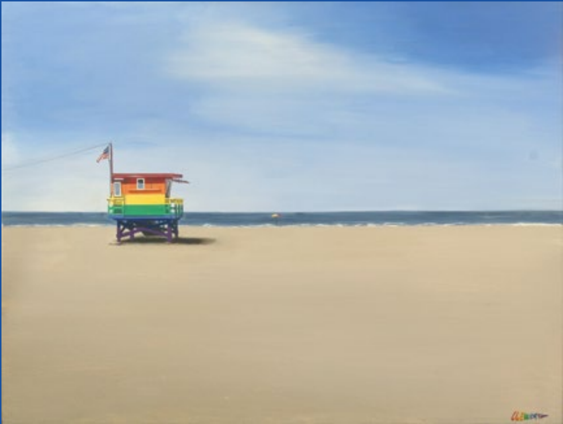
Harold Cleworth, Pride Tower , Acrylic on canvas, 48" x 36", 2020