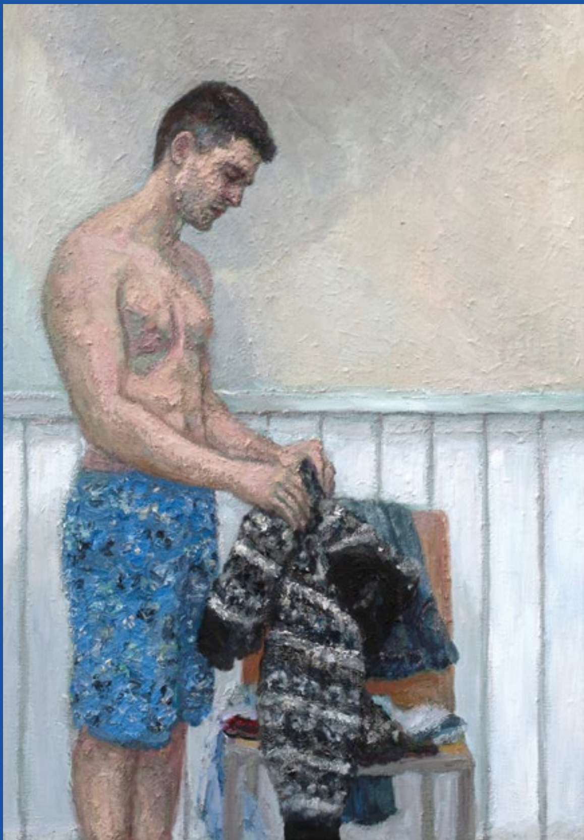
Dror Yisrael Hemed, Guest II , Oil on canvas, 60 x 41 inches, 2022