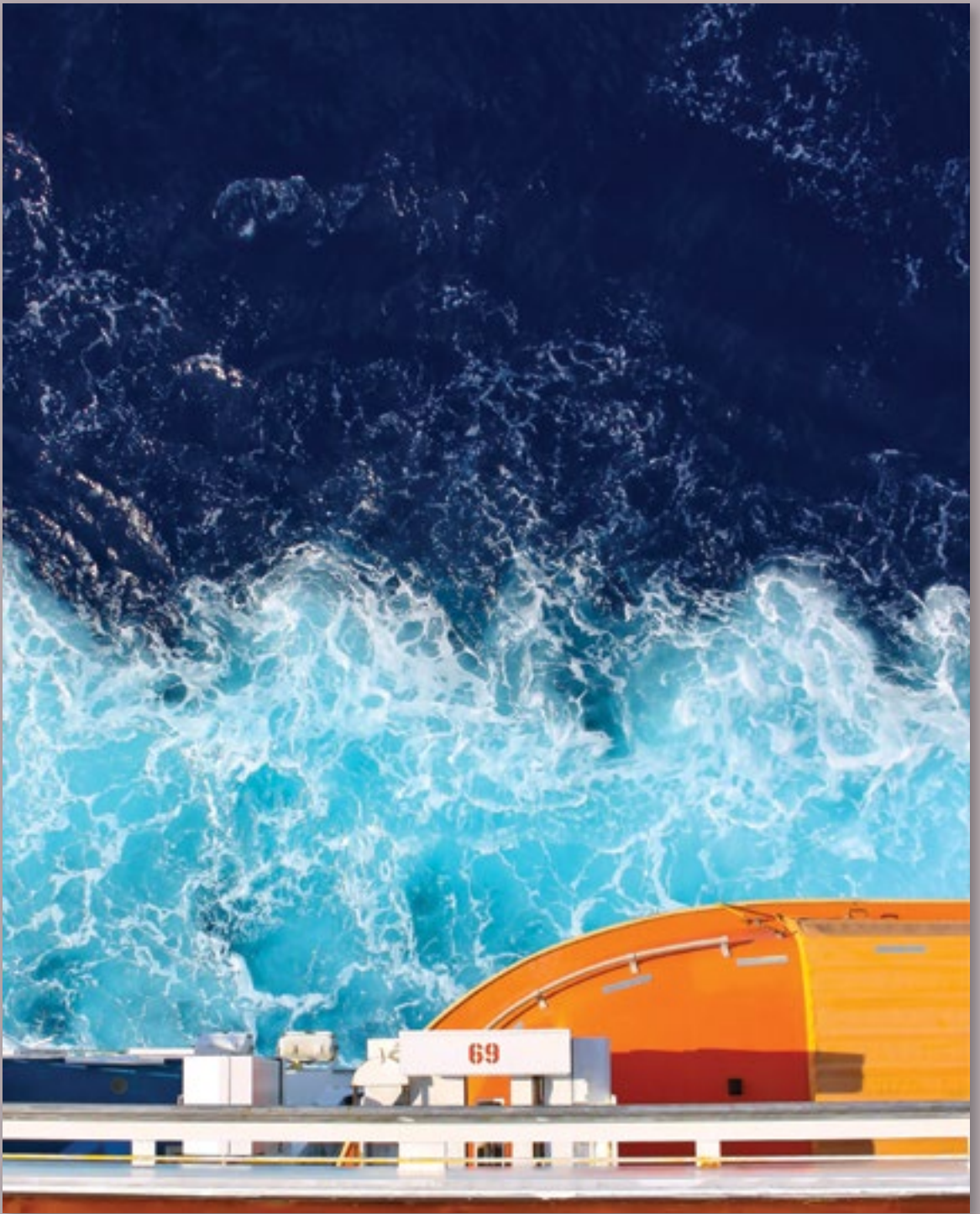
David Stine, Movement and Escape , Digital photography, 36" x 48", 2012