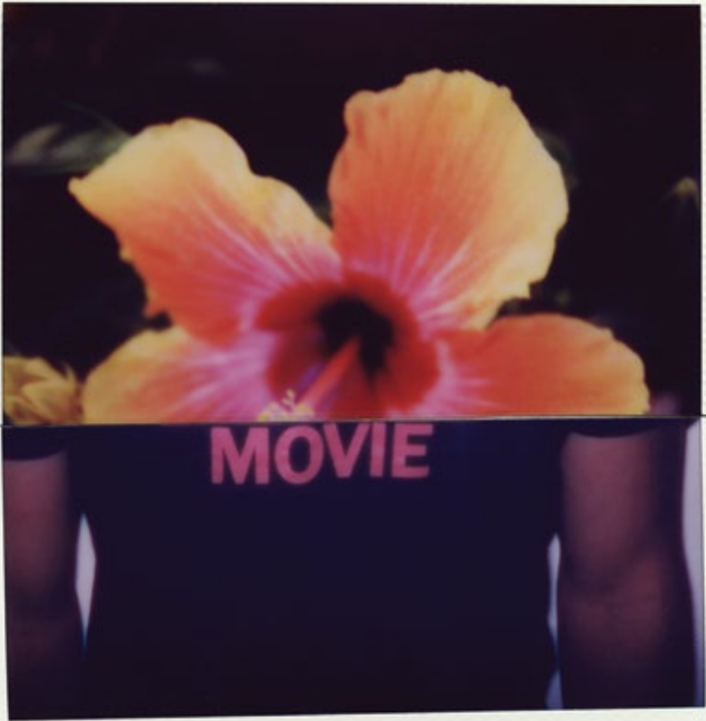
Stuart Sanford, Polaroid Collage XVI , Polaroid, 2022