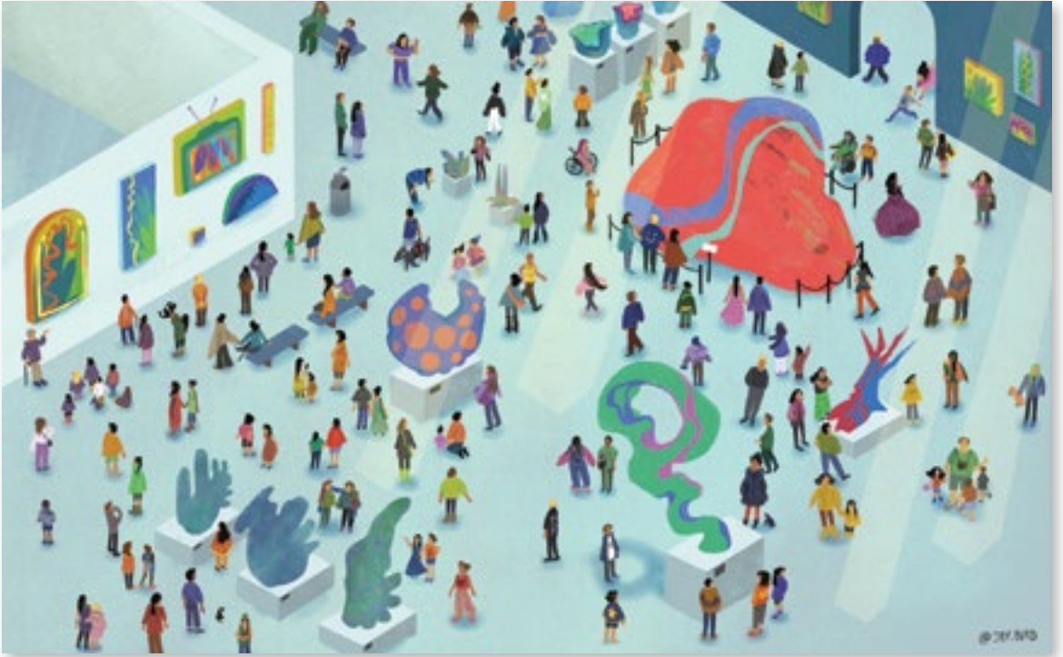
Jay Marsh, Happy Museum , Digital, 16" x 10", 2023