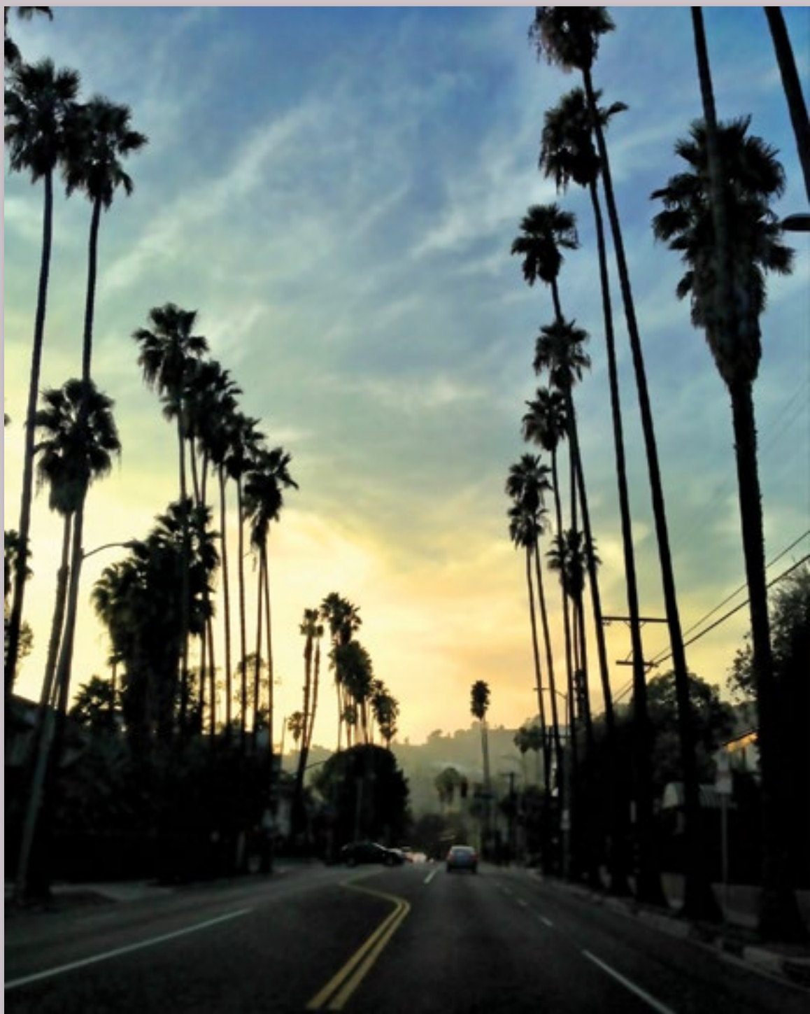
David Stine, Stand Tall on Hollywood , Digital photography, 8" x 10", 2017