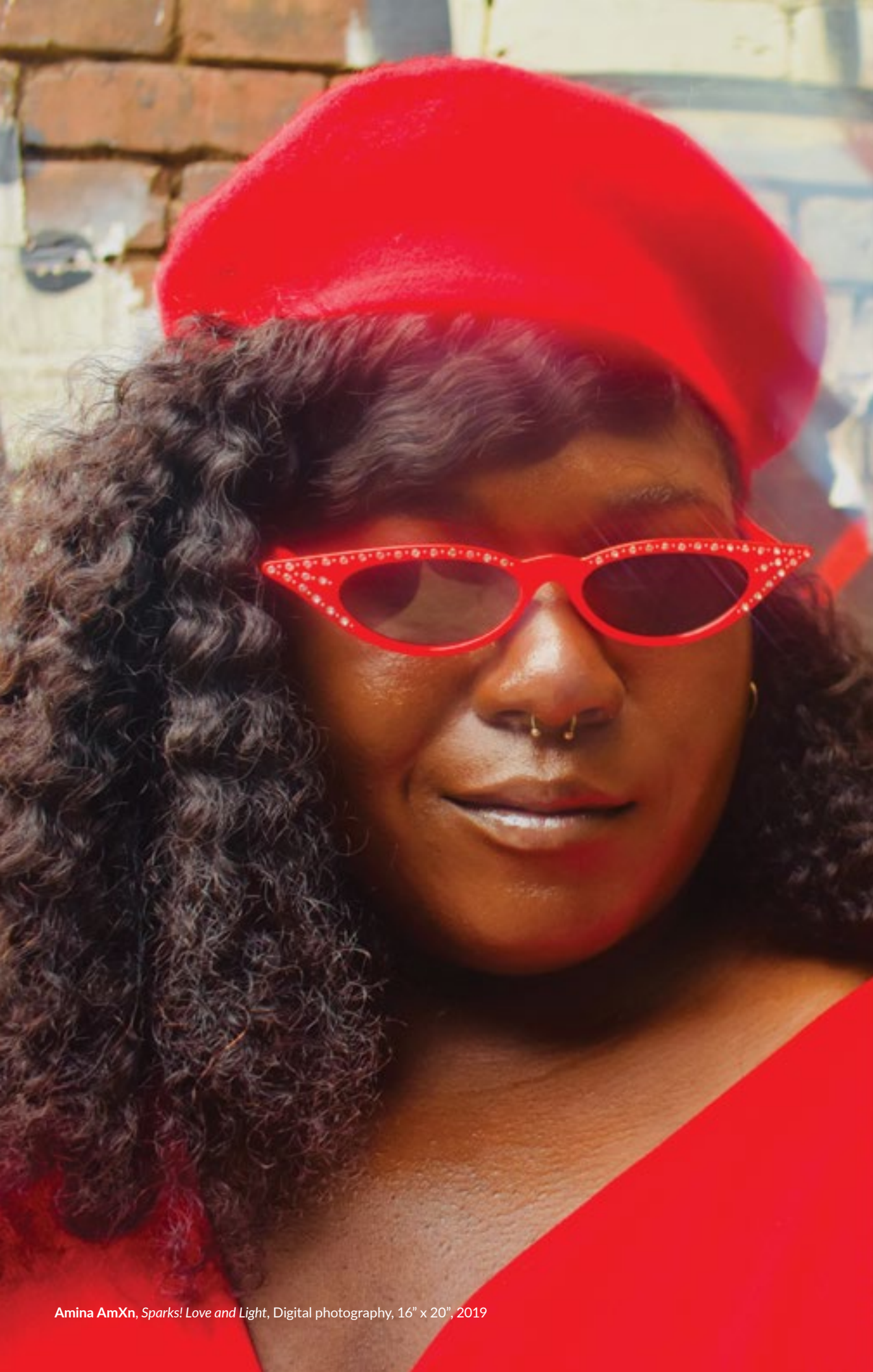
Amina AmXn, Sparks! Love and Light , Digital photography, 16" x 20", 2019