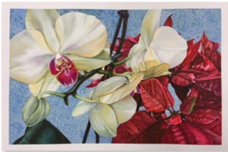
Linda Rygh, Orchids , Watercolor, 13" x 20", 2022