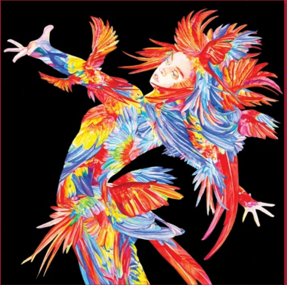
Holly A. Vigil, Bird of Paradise , Watercolor, 20" x 20", 2022