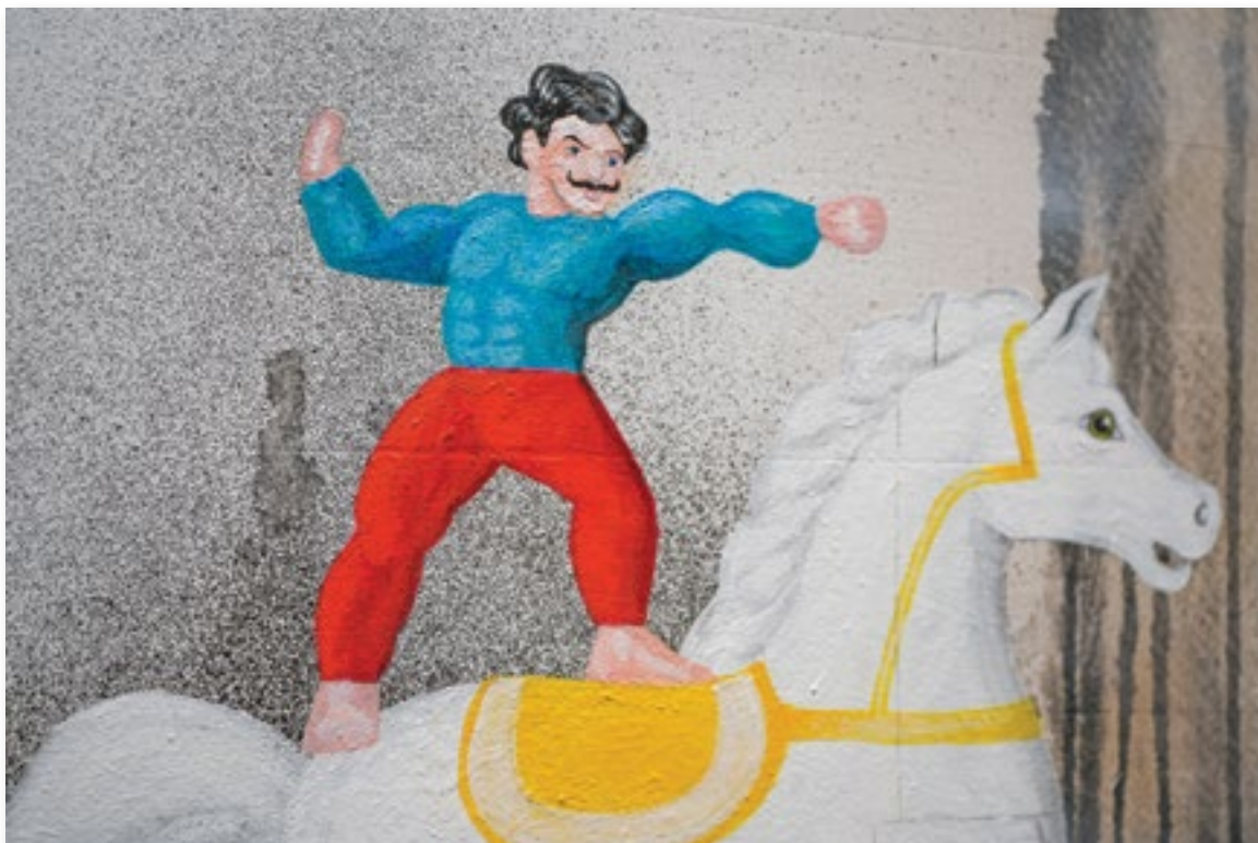
Vojislav Radovanovic, detail from: Everyday Balancing Act , Mixed media on canvas, 40" x 54", 2022