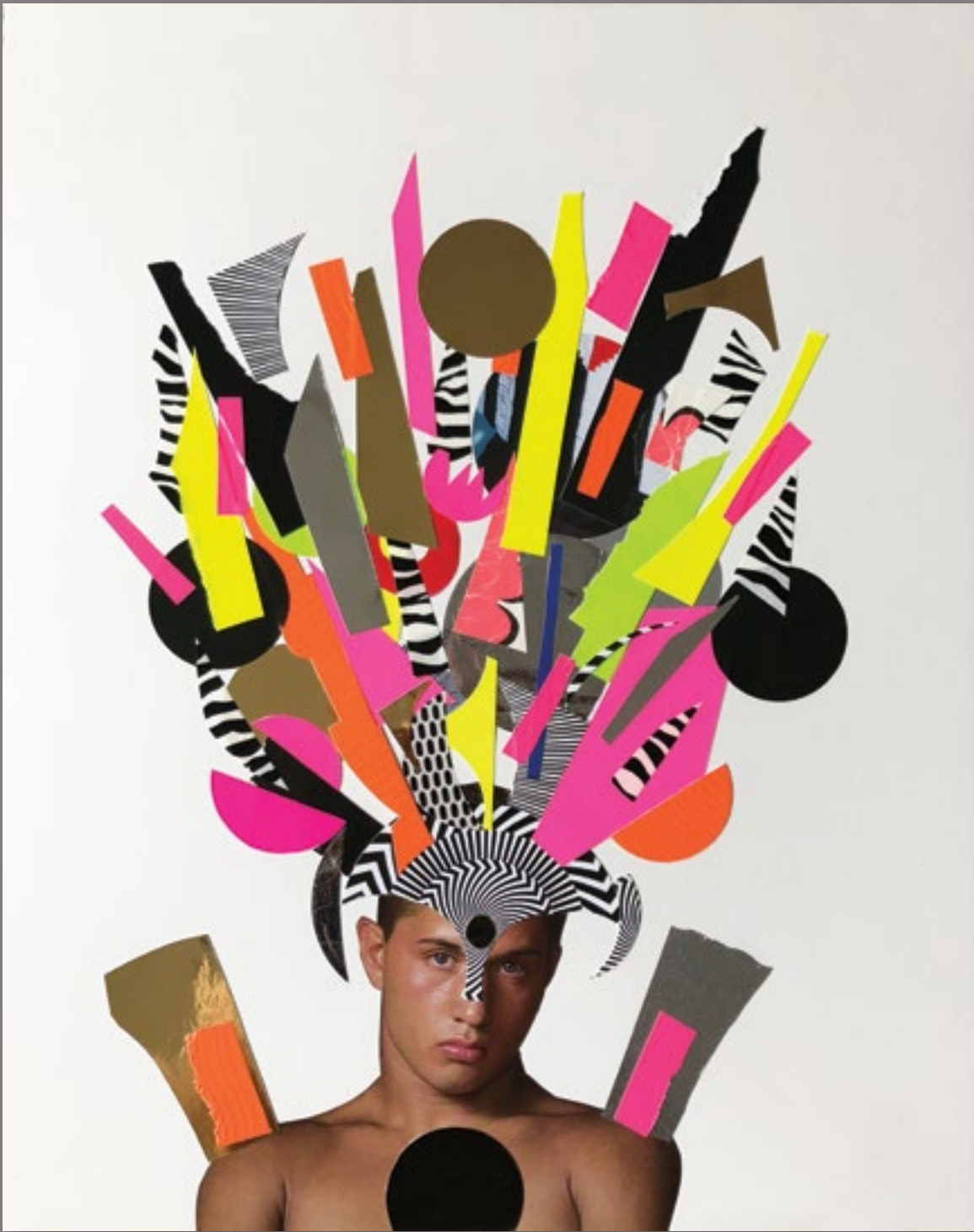
Rubén Esparza, Castillo Headress , Mixed media collage, 20" x 16", 2016