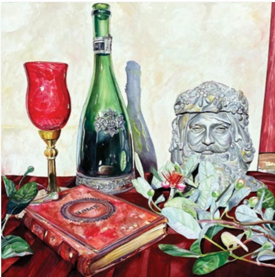
Holly A. Vigil, Still Life , Watercolor, 20" x 20", 2022