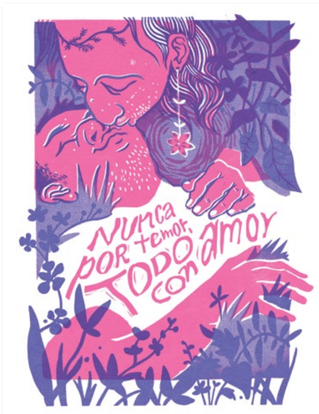
Tzasná Pérez Espinosa, Todo con Amor , Digital, 2022