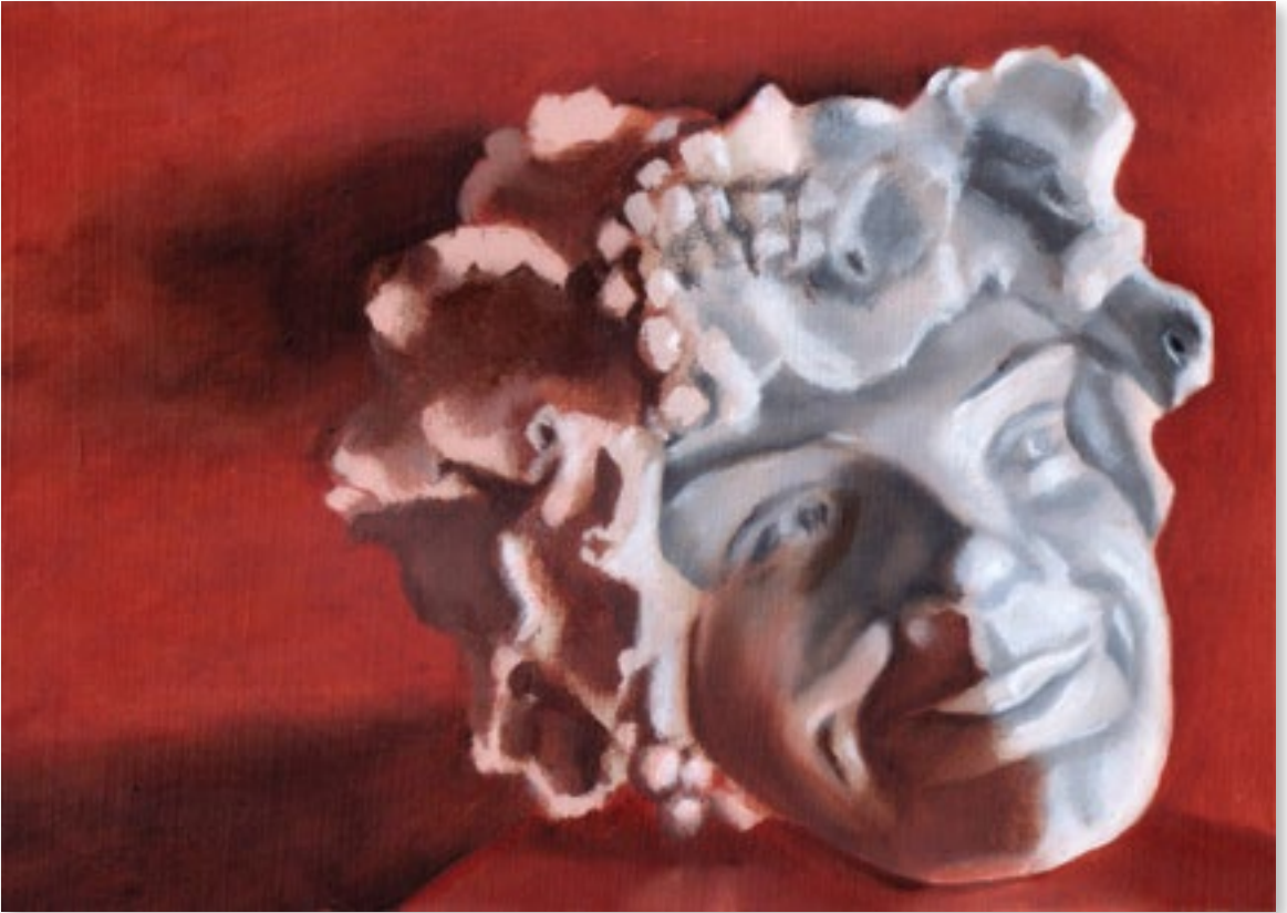
Ed. de la Torre, Plaster Bacchus Mask in a Red Room , Oil on paper, 5" x 7", 2023

The exhibition pays tribute to Walker's distinctive contribution to image-making while also highlighting the work of his creative collaborators: set designers, stylists, makeup artists, models, and muses. At the heart of the show is a new series of photographs inspired by his research into the collections of the Getty Museum and the Victoria and Albert Museum (V&A), London.