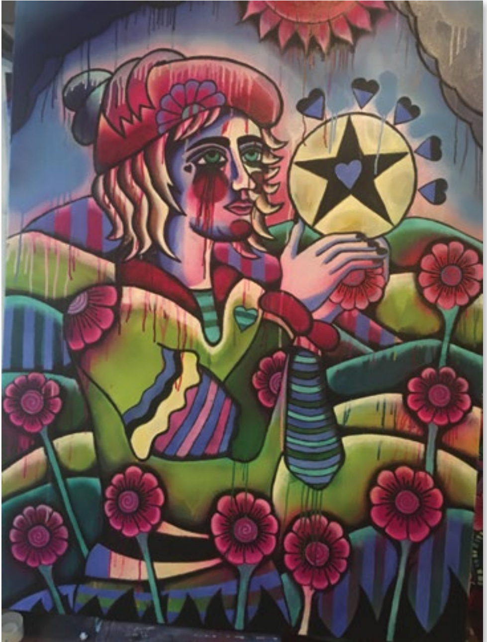
Katie McGuire , Page of Pentacles , Spray paint and oil paint-canvas, 3' x 4', 2022