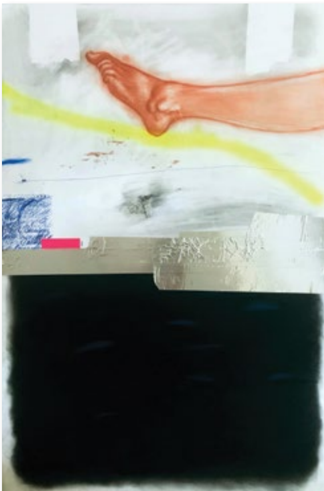
Rubén Esparza, Feet of the Gods (Di Caravaggio) No. 5 , Mixed media collage, 36" x 24", 2022