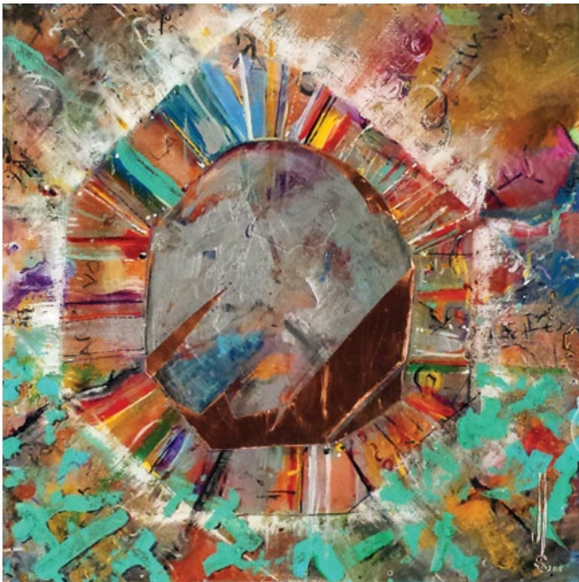
Jason Soltero, Portal 3 , Copper, epoxy, and acrylic on wood, 30" x 30", 2015