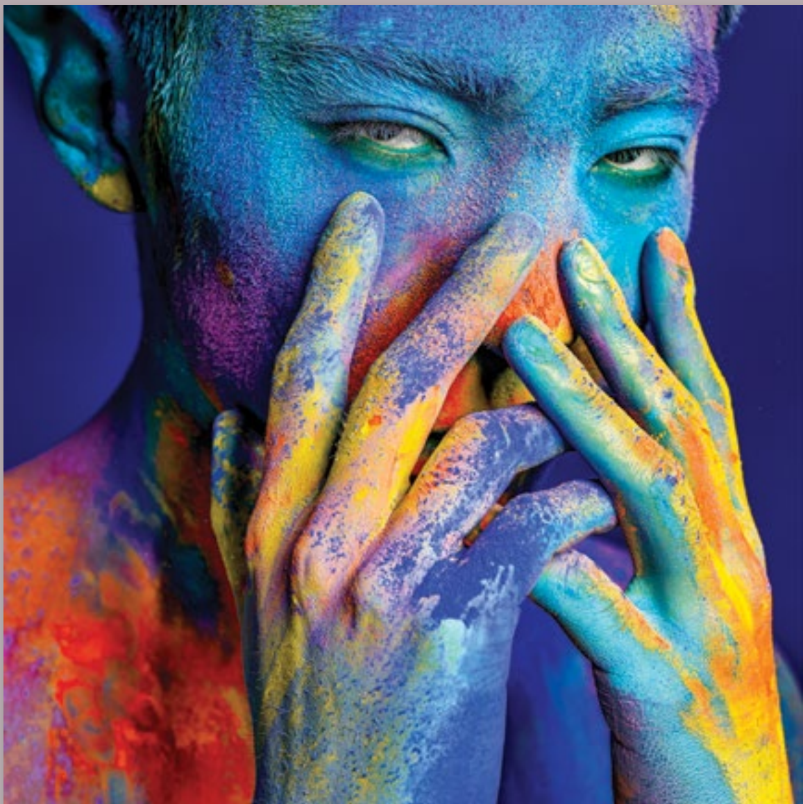
Tirdad Aghakhani, Rainbow , Digital photography, 20" x 20", 2022