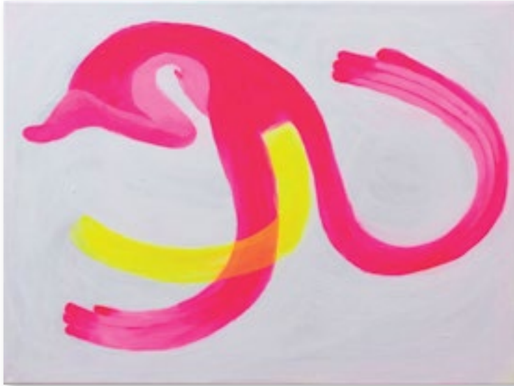
Oscar Corona , Miserablism , Acrylic, mixing medium, gesso, 16" x 20", 2022

Through its professional theater facilities, DCA serves the performing and media arts community by offering below-market theater rentals. In turn, the arts community presents year-round dance, music, theater, literary, and multi-disciplinary performances; supports the development of emerging and established Los Angeles-based performing and media artists; and offers workshops for playwrights and writers of all ages.