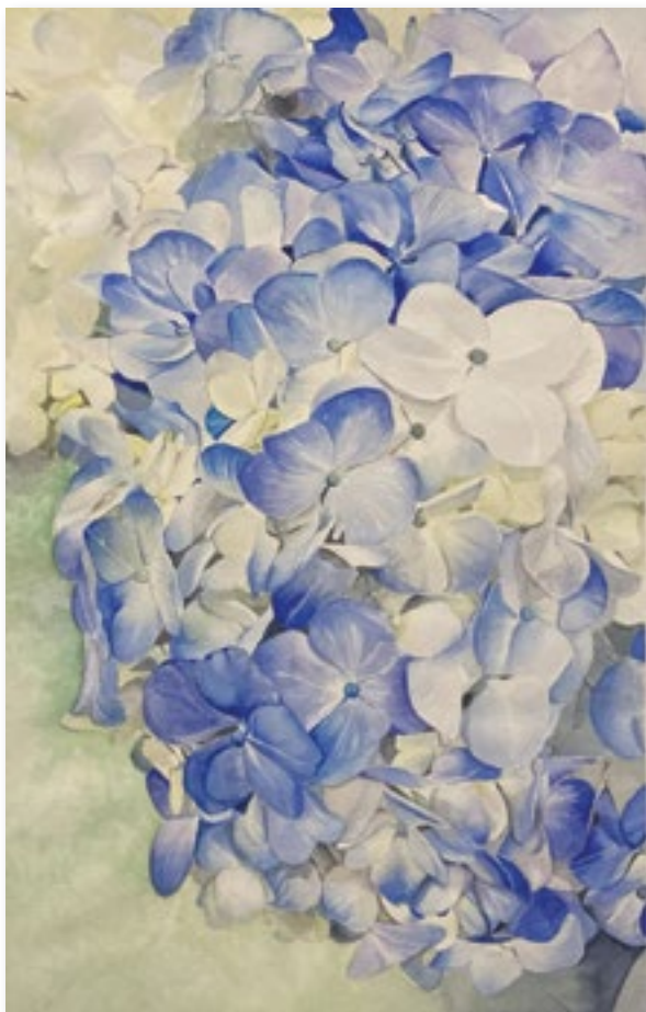
Baoyi Cao, Hydrangeas , Watercolor, 13" x 20", 2022