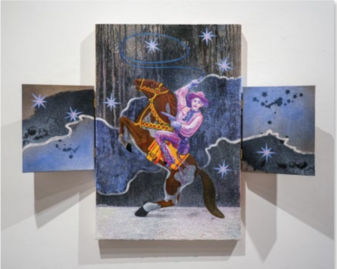
Vojislav Radovanovic, Star Wrangler , Assembled triptych, acrylic on canvas, 36" x 48", 2022